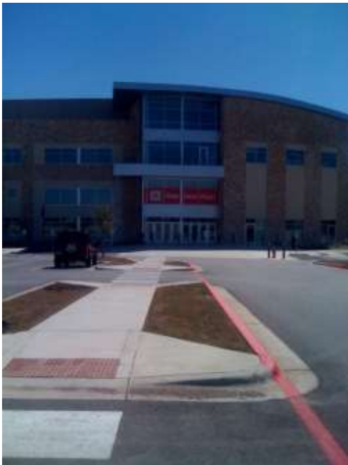
State Farm Plaza - Northwest Entrance